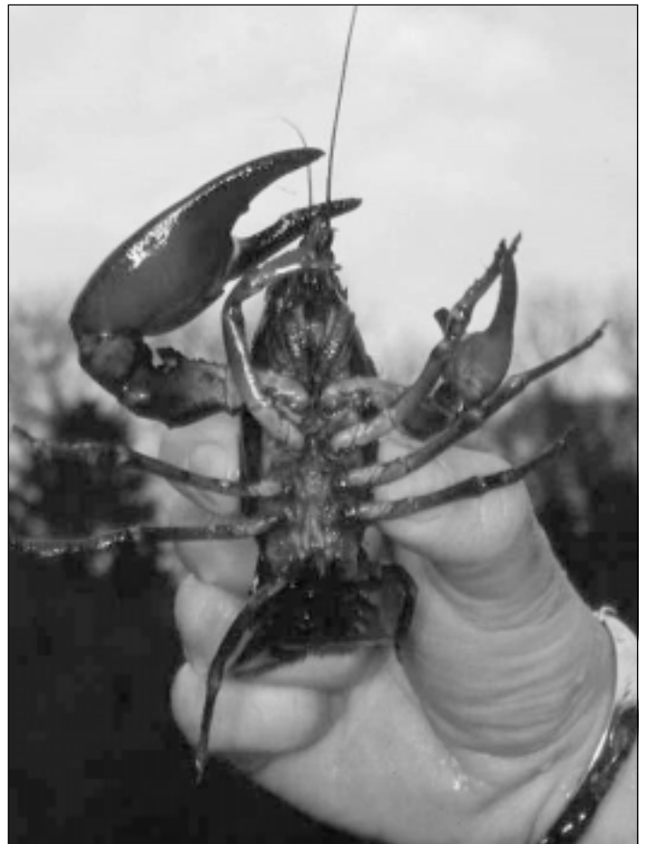
It is illegal to introduce signal crayfish to Scottish waters.