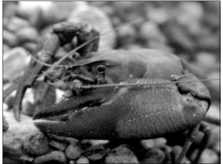
Signal crayfish have been found in the River Nairn

Signal crayfish in the wild are officially classified as pests, and once established are almost impossible to eradicate. At its nearest point the Nairn catchment is only 20 km from the River Spey, but is separated by the River Findhorn. Every effort must be made to prevent the spread of crayfish in order to protect local salmon and trout stocks and the River Spey Special Area of Conservation.