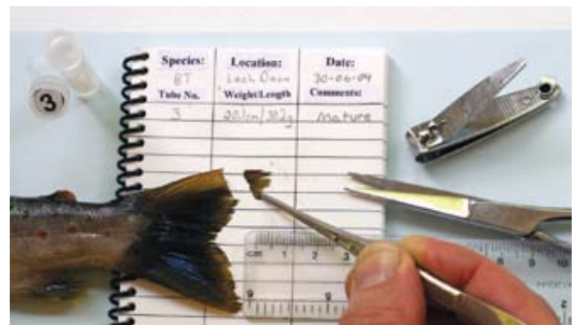
Tissue samples are taken from fish for genetic analysis

Breeding populations are the fundamental units underpinning recruitment and defining the character of a river's Salmon stock. It is therefore essential to understand a river's population structure for the development of effective stock conservation and management plans. Identifying breeding populations can be achieved by the analysis of heritable variation in the DNA of Salmon. Genetic variations in human beings are used to determine paternity or identify criminals with crimes they have committed. These techniques can also be used to investigate population structuring in Atlantic Salmon stocks as each Atlantic Salmon has a unique combination of genetic variants by which it and its offspring can be identified.