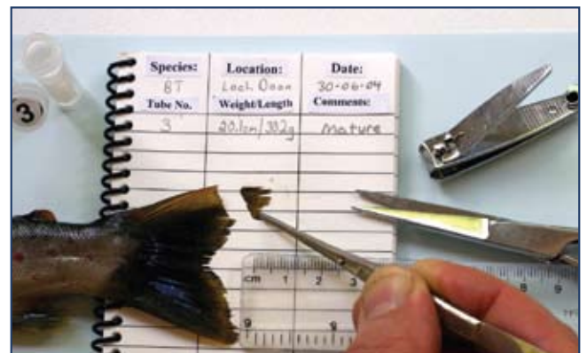
Over 6,000 tissue samples have been taken from fish throughout the Spey catchment for the FASMOP Genetic Analysis Project.

followed by the Salmon smolts from our rivers. Furthermore, an internal Marine Scotland project (POP MOD) on the development of general predictive models of within-river structuring of Atlantic salmon, by integrating data sets across catchments, will further improve the ability to interpret river specific data sets under FASMOP. These additional analyses will extend the data set available for FASMOP – improving the numbers and sizes of samples analysed and the level of coverage for the system.