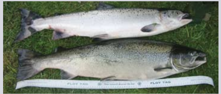
Farmed salmon and wild salmon from Lower Wester Elchies. Again note the difference in condition of the tail fins, otherwise the farmed salmon was in very good condition.