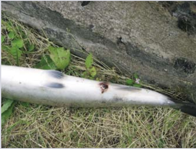
Photo 3. Grilse from the River Avon showing red vent condition